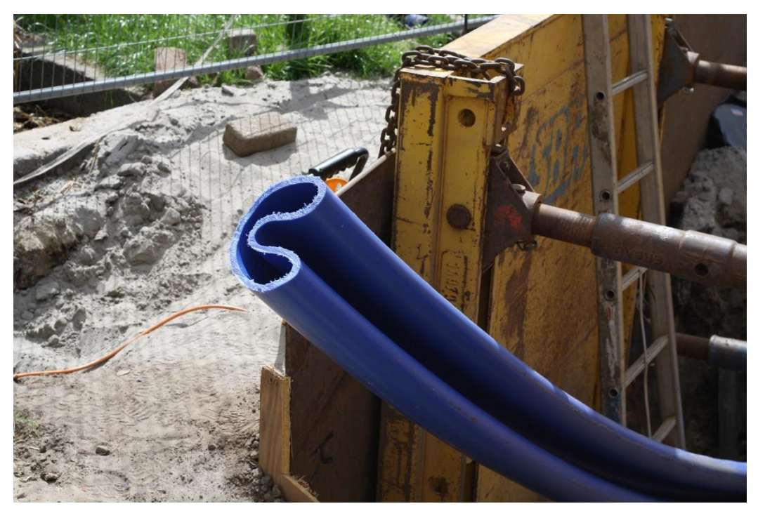
Figure 2 Application of Compact Pipe in Zwaagwesteinde, Friesland.