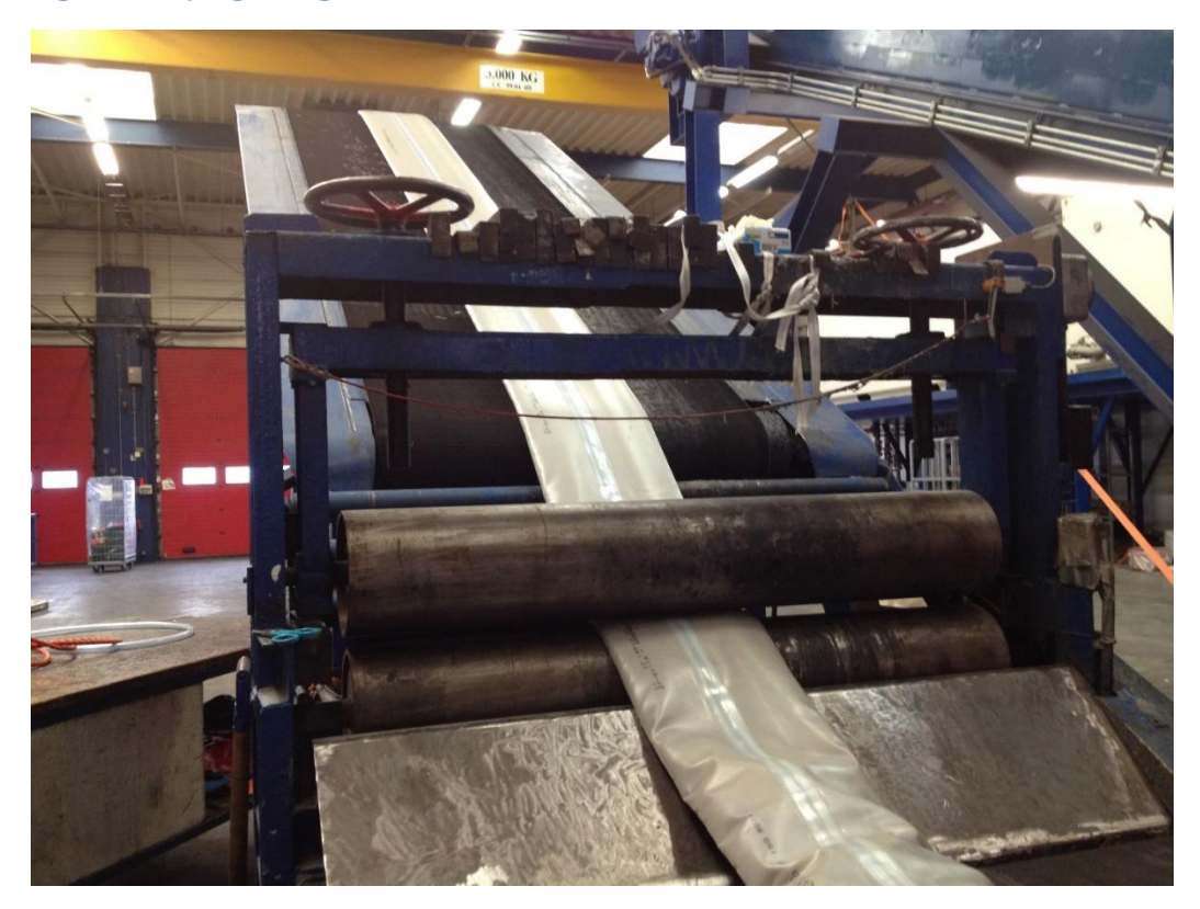
Figure 1 Impregnating a liner with resin.

In the pilot project a section of 550 meters of 400 mm diameter AC pipe was rehabilitated. It's condition was estimated beforehand as in need of replacement. Condition assessment by means of a non-destructive assessment in combination with an exit assessment revealed that the pipe actually would have had a remaining service life of about 25-30 years.